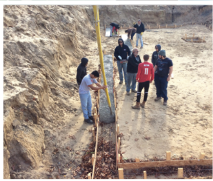
Portage Construction Trades students work on footings for a brand new house.

State awards will be granted in February.